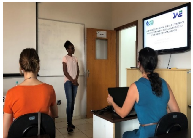
Figure 2 BHEARD scholar from Mozambique during her thesis defense.